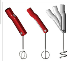
Cordless Hand Blender