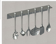
Stainless Utensils & Rack

Designed by Yvette Chaparro of Studio Gelato Created in Cobalt