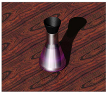
Glass Wine Decanter

Yvette Chaparro of Studio Gelato has recently completed the Reach for Your Dream three month trial of Cobalt and Graphite and has moved on to 50% off the monthly rental price. To receive the discount she submitted some excellent files of products created in Cobalt including these handsome housewares, now posted in our Gallery.