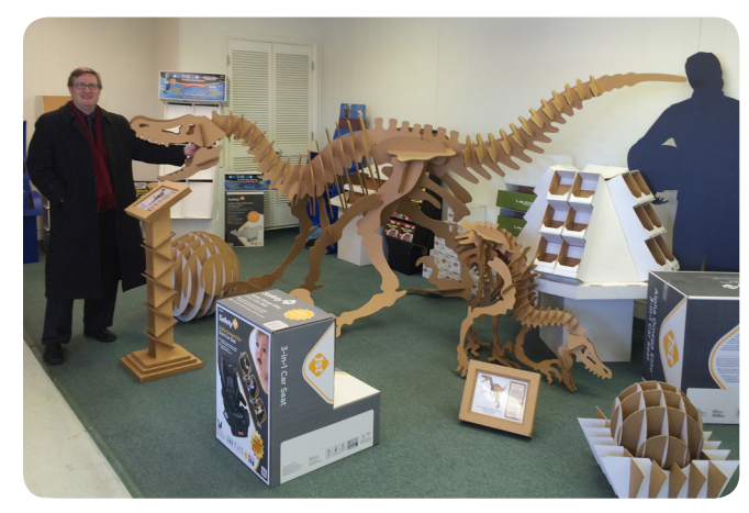
Nova Pak design samples of point-of-purchase displays, standees, and Corraboardosaurus (KOR-o-BORD-o-SOR-is).