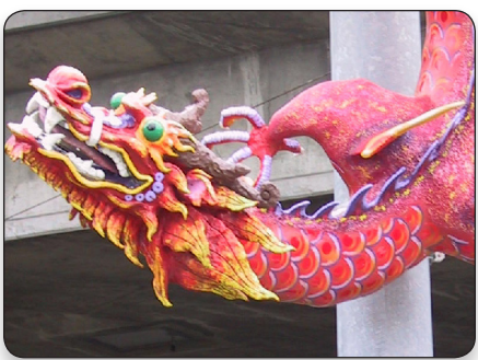
Brunt designed and fabricated 11 of these Chinese dragons using Cobalt for Seattle's International District.

Brunt's parting words of advice, "Detail it with Cobalt, pass it to production and have fun! Cobalt takes the devil out of the details."