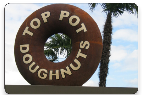
Three-dimensional signs, like this one for Top Pot Doughnuts, are just some of the interesting things Brunt designs in Cobalt.