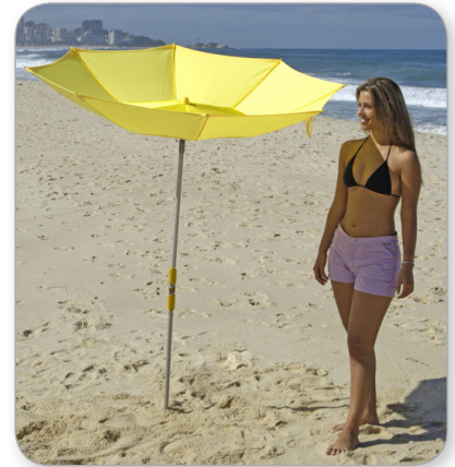
The award-winning Spirit sunshade.

Shortly after release, the Spirit won Germany's coveted iF International Forum Design award for leisure and lifestyle.