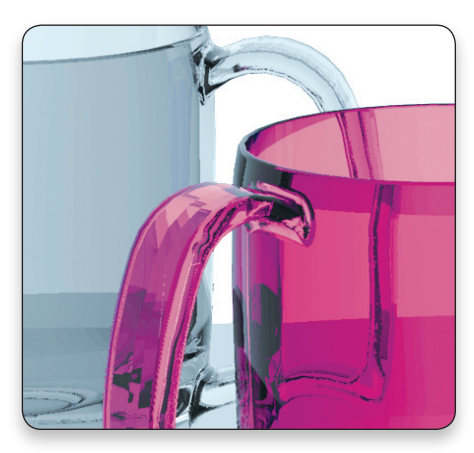
The Optima Mug is now in full production and available from Village Mill in a range of colours and options.

In the end, the Cobalt<sup>™</sup> model was used to generate an STL file for a rapid prototype before exporting the surfaces directly to the toolmaker's CAM system. "After the first moulds were made, I had a call from the customer to tell me that the light refraction on the renderings was identical to the actual product."