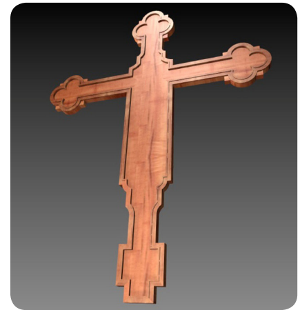
Both above: Jueri often photographs the actual piece of wood and uses it in Xenon renderings like these of the Art Deco style table and this cross.