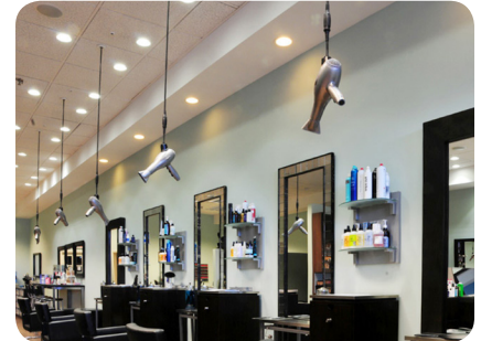
The Freestyle weightless blow drying system.

"I like how intuitive the drawing is. If you take something like AutoCAD and Solidworks and stuff like that, you kind of go through a lot more hoops than you do with Xenon. Mainly it's a very intuitive program to use."