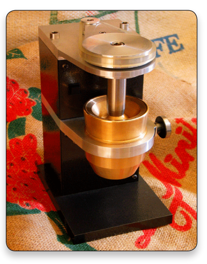
The M3 Grinder's revolutionary design eliminates all residual grounds so there are no oxidized remains from previous grindings.

For the next version of the M3, Bicht is moving from Graphite to Xenon. He will start generating interest among coffee connoisseurs using photo-realistic renderings prior to ever building a physical prototype. Says Bicht, "Ashlar-Vellum allows us to make the M3 Espresso System the most amazing espresso equipment anywhere in the world."