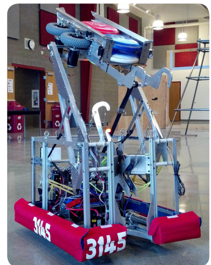
RoDel, the TeraViks' winning robot.