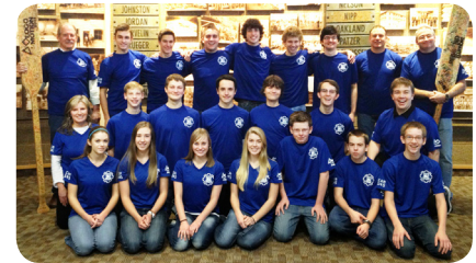
FRC Team 3145 TeraViks from Coeur d'Alene High School, Coeur d'Alene, ID.

These 19 enthusiastic students not only developed engineering and marketing skills, but also learned about beam deflection, statics and strength of materials, troubleshooting and public speaking. They used their passion for design and fabrication to create an award winning solution.