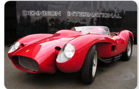
The fully restored Ferrari won Best-of-Class at the prestigious 2006 Pebble Beach Concours d'Elegance in Carmel, California.

Speakes holds three patents. He believes creativity, leveraged with the intuitiveness of Cobalt, breeds success, and continues using it to design and fabricate everything from aircraft parts to architectural pieces.