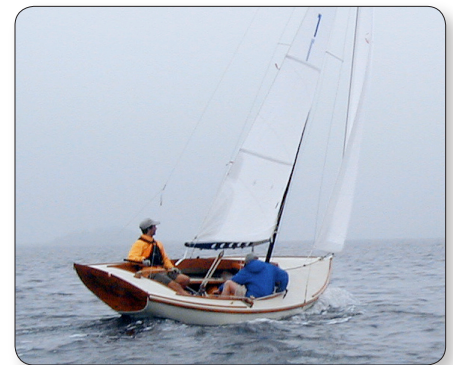
The Arey's Pond daysailer, Nimble, approaching hull speed in five or six knots of wind. In a moderate breeze, she is capable of doing 7 knots!