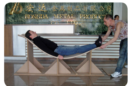
Testing the precision of the 3D design during prototyping.