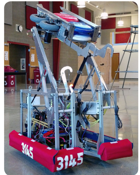
RoDeL, the First Robotics Team 3145 robot by students at Cœur d'Alene High School.

Ashlar-Vellum is a proud sponsor of Cœur d'Alene High School's TeraViks, the FIRST Robotics Team 3145 from northern Idaho. The student robotics team used Graphite CAD software to complete the design and demonstration of their 2013 entry. Each year, a different challenge is set to build and program a robot that will perform some variety of functions. This year's competition, called "Ultimate Ascent," had two primary tasks. The first