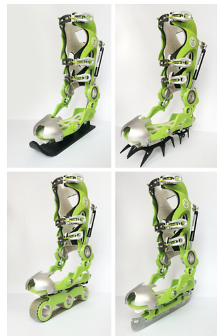
The PowerSwat's rollers are easily switched for mini skis, ice crampons, caterpillar tracks or ice blades.