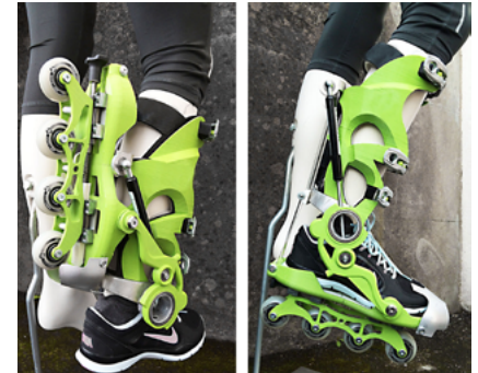
The PowerSwat in closed position, for easy walking and in open position, ready to glide.

Cobalt gives Livio Ronchetti the flexibility to bring a product as diverse and imaginative as the PowerSwat inline skate to real life. ❖