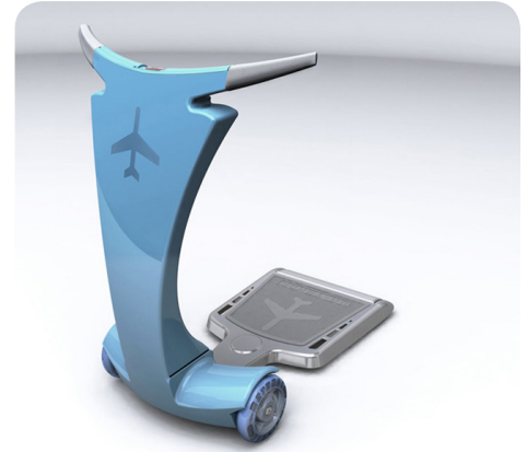
The On-Track electric airport scooter designed in Cobalt CAD and 3D modeling software.

He continues, "With Cobalt's comprehensive tools, we can create any shape, but its real strengths are the 3D Drafting Assistant™, the user interface, the intuitive approach and the pleasure it is to use. These things are fundamental, the real spirit of the software." ❖