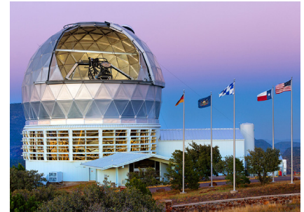
The Hobby-Eberly Telescope at the University of Texas McDonald Observatory.